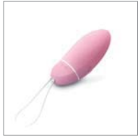
Pink 7350075 021015