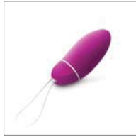
Deep Rose 7350075 021022

Product images available in ALL colors in our Retailer System ( www.lelo.com/retailer ).